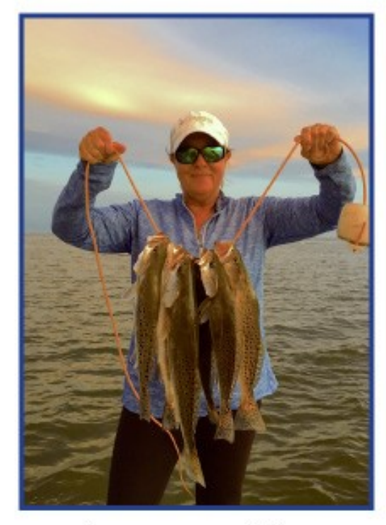
ANGLETZ OF THE YEATZ