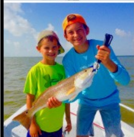
Haden & Hudson 1st slot red