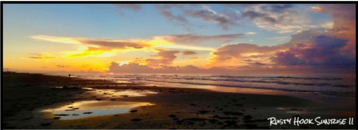
RUSTY HOOK SUNRISE II