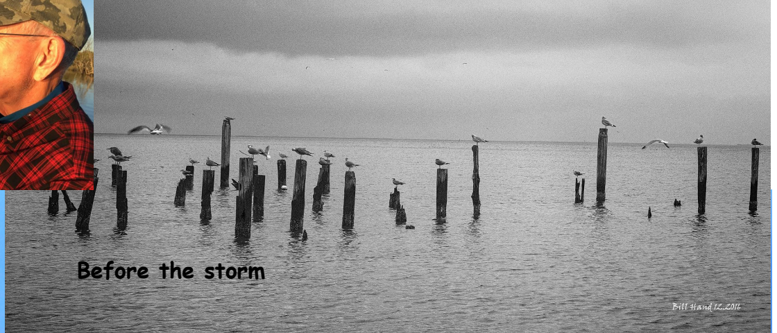
Before the storm