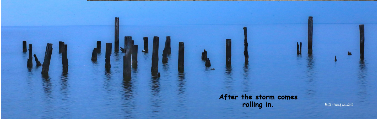
After the storm comes rolling in.